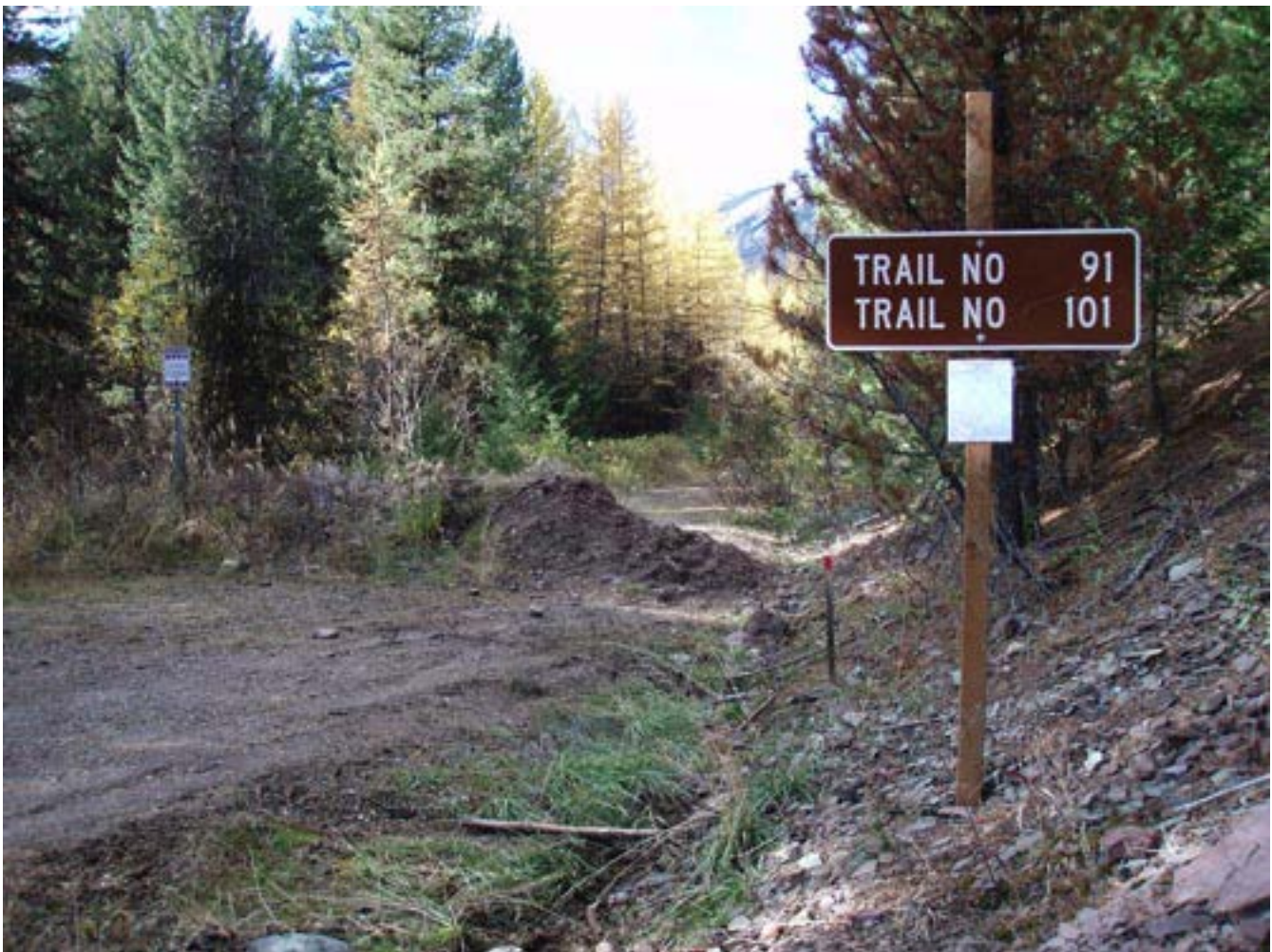
Road end, trailhead and detour over shaved berm.