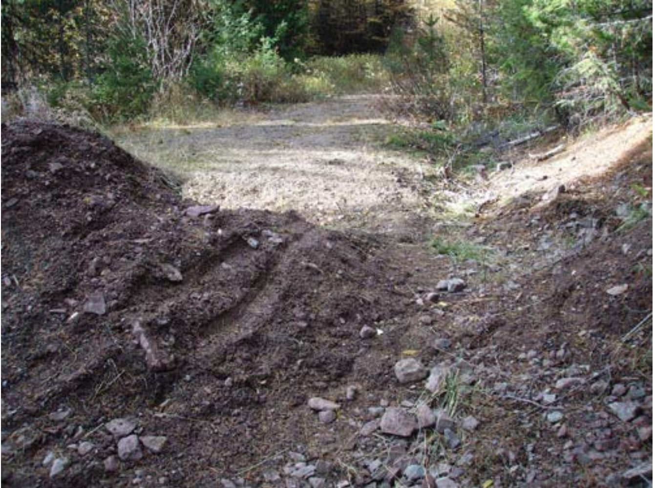
Narrower tire tracks over and around the berm - fairly fresh.