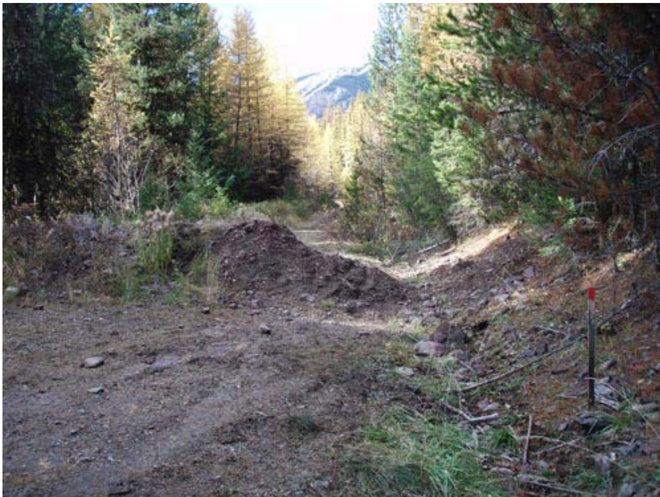
Wide tire tracks leading to detour over berm.